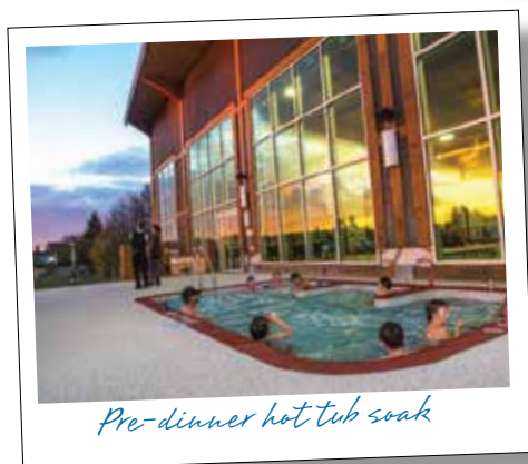
Pre-dinner hot tub soak