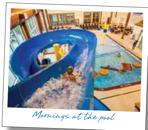
Mornings at the pool