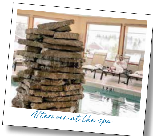
Afternoon at the spa