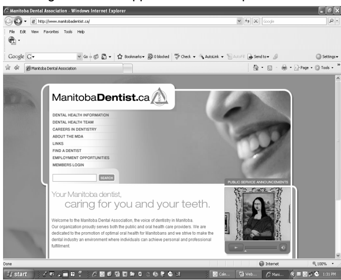
Step 1: Access site: <a href="www.ManitobaDentist.ca">www.ManitobaDentist.ca</a> . This following screen will appear. This is the public site.

Step 2: Click on "Members Login". The following screen should appear. Your MDA ID is your unique or license number. i.e. "512-345"